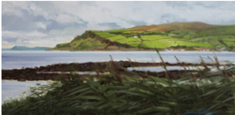
Antrim Coast Paintings Private Collection Various Sizes Oil on Linen or Oil on Canvas