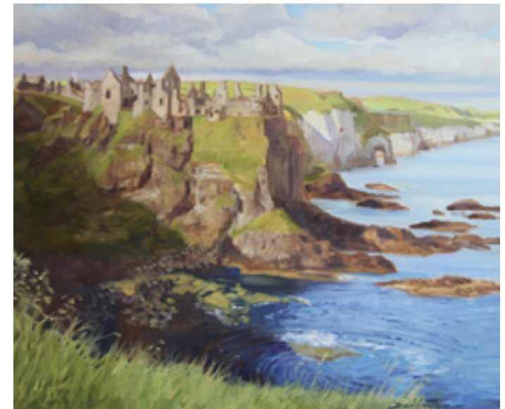
Dunluce Castle - From the Headland Private Collection 20 x 24 Oil on Linen

To capture the Gothic grandeur of the castle ruins, I made field sketches and took many photographs over a five day period, combining many elements to create these two paintings with their very different moods.