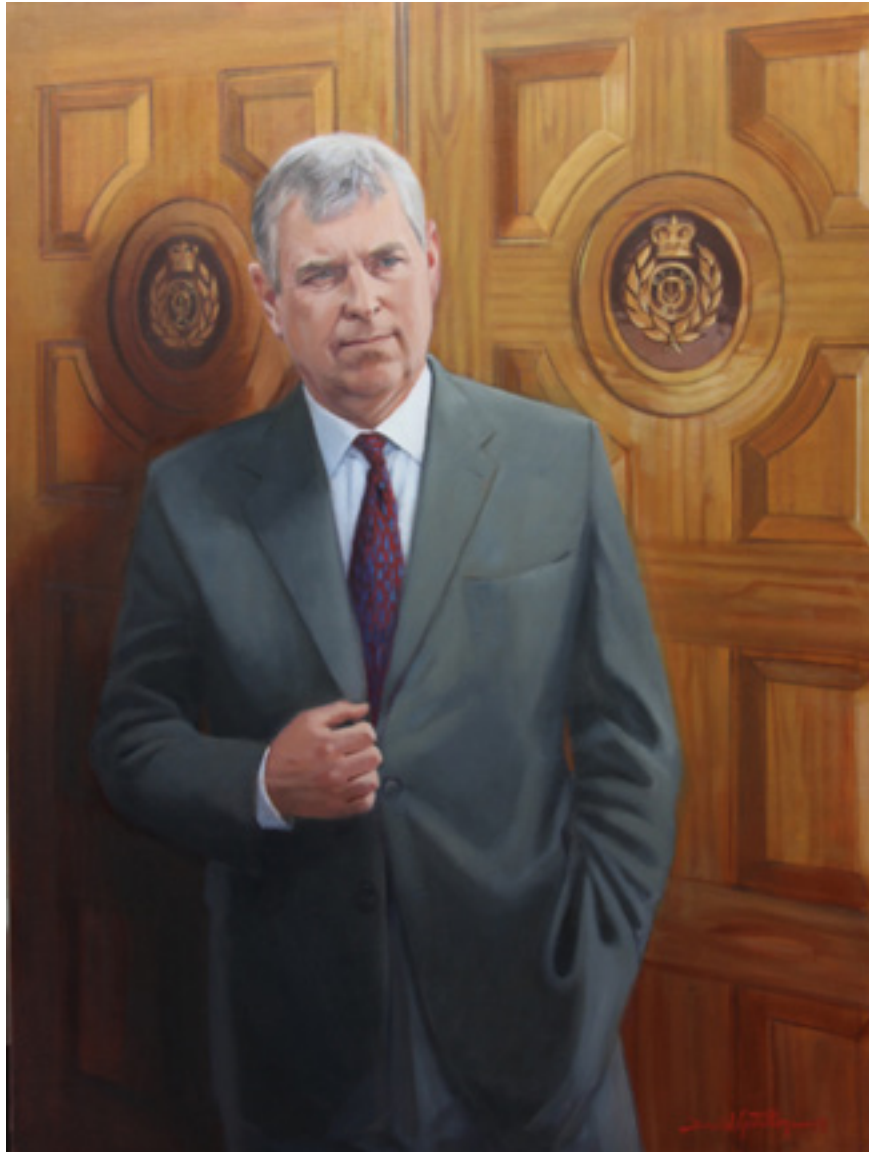
HRH Prince Andrew, The Duke of York Collection of the Royal Victoria Yacht Club 40 x 30 Oil on Linen

Those of you who read my July 2013 Newsletter will know that 2012/2013 was an exciting and busy time for me. The second half of 2013 has continued in the same vein with a variety of stimulating projects.