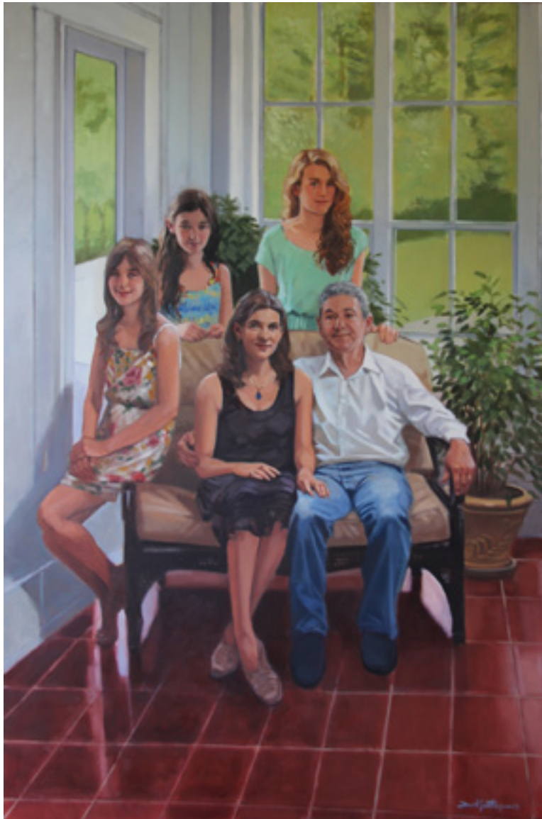
Private Collection 60 x 40 Oil on Linen

This light-filled, informal setting combines the family's love of the outdoors with the pleasures of home.