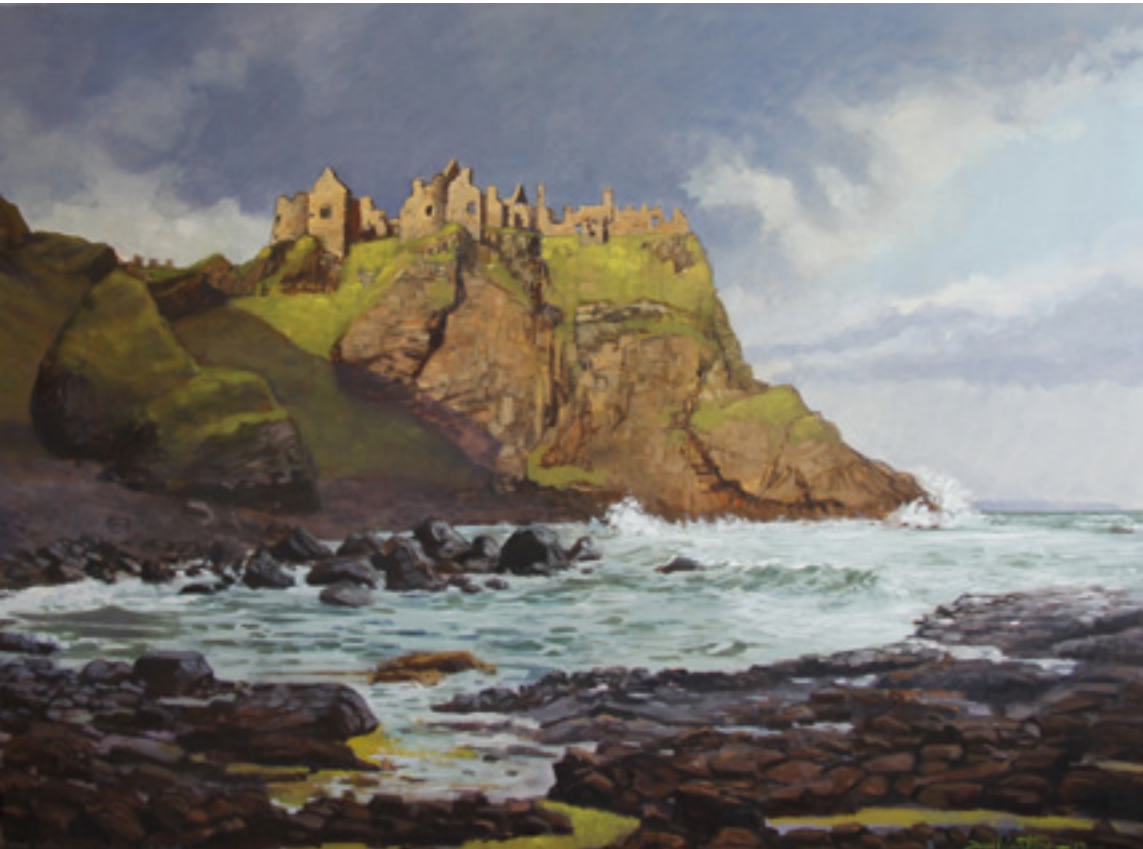
Dunluce Castle - From the Beach Private Collection 36 x 48 Oil on Linen

Now and again I am commissioned to paint a landscape or cityscape. The commission to paint a portrait of Dunluce Castle took me to the Antrim Coast of Northern Ireland and on an exploration from Belfast to Donegal, winding up in Dublin.